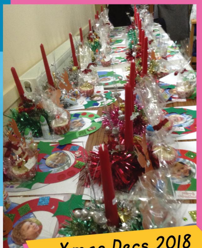
Xmas Decs 2018