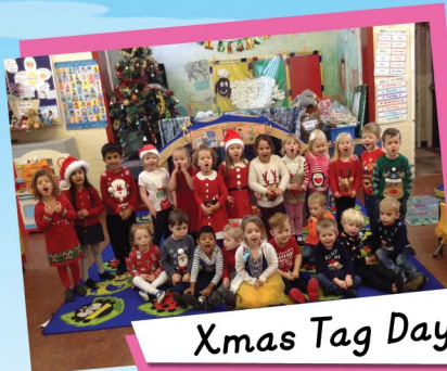
Xmas Tag Day